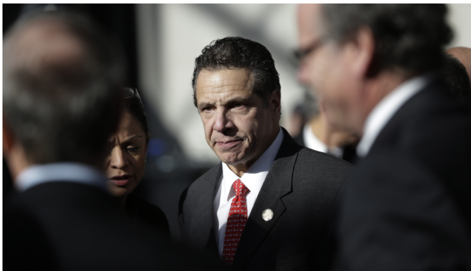
Cuomo.